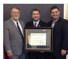
Sen. Jason Rapert AR State Senator